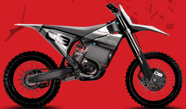
FLUX P1 DESIGN